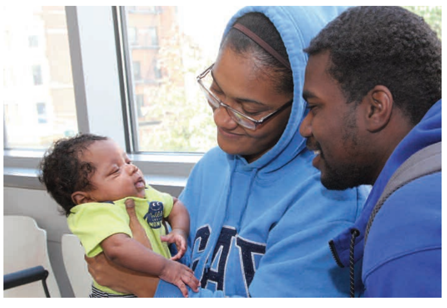
William F. Ryan Community Health Network 110 W. 97th Street, New York, NY 10025

Call 212-316-7944 for more information on specific projects or programs.