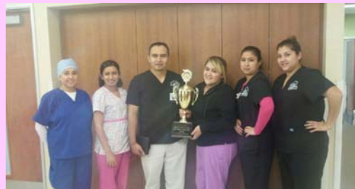
KERN - Arvin Dental Center

We want to THANK all of the winners for their hard work and commitment to provide great customer service to our patients. They were rewarded with a large trophy and a pizza party. Way to Go! Let's see you gets next quarter's trophy!!