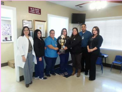
FRESNO - Easton Community Health Center

Each site was rated on six categories ranging from patient loyalty to courtesy and helpfulness of medical staff, on a quarterly basis.