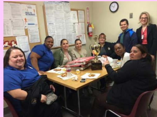
KERN - Family Health Center.