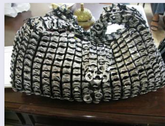
A purse made from soda can tops woven together, a borrower's unique accessory item made from recycled materials.

This is part one of a two part feature. The next issue will highlight a member business and story.