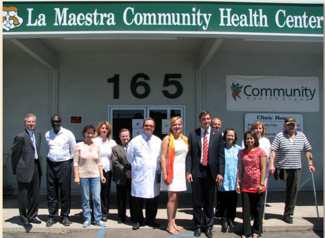
La Maestra's team, community residents and Congressman Hunter.

Congressman Duncan Hunter visits with local residents, military veterans and the medical and executive staff of La Maestra at the La Maestra Community Health Center in El Cajon. After the closure of an East County hospital lead to a reduction in available health care services, La Maestra opened the satellite medical center in 2004 and followed with a dental center the same year.