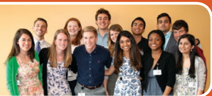
CHC's AmeriCorps Class of 2014 Graduates