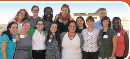
2014–2015 Nurse Practitioner Residents