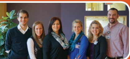
2014–2015 Post-Doctoral Residents