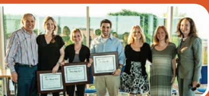
2013–2014 Post-Doctoral Residents

Patients who are seen at one of the participating CHC sites will be screened by medical staff using SBIRT, for alcohol abuse, substance abuse and depression to determine underlying health issues that require further follow-up. Coupled with CHC's use of the immediate care ("warm hand-off") model, patients who screen positive for use disorders and depression can be seen immediately by a CHC behavioral health provider. Added screenings will also allow our behavioral health providers to refer patients with very complex needs to higher levels of care as-needed.