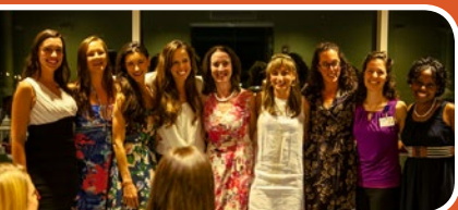
2013–2014 Nurse Practitioner Residents