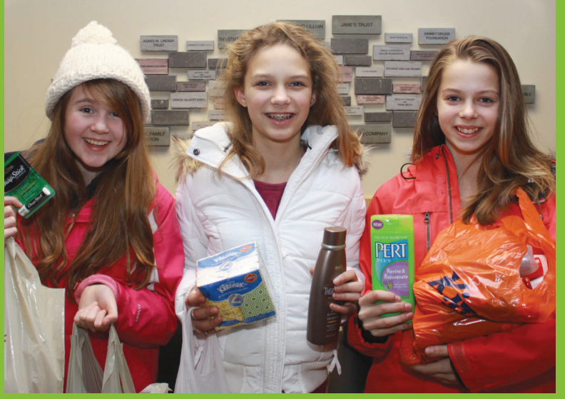
Edmunds Middle School students coordinated a drive to collect toiletries for CHCB.

Community Health Centers of Burlington DONORS ARE THE FOUNDATION OF OUR MISSION