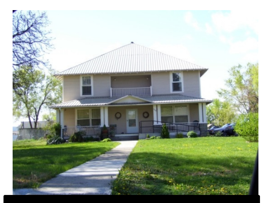
Supportive Housing Programs – Private Landlords, YWCA, Triumph, Housing Authority