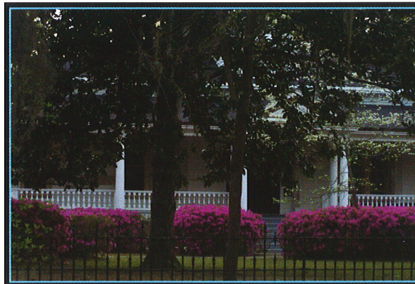
Southern Living at its Finest