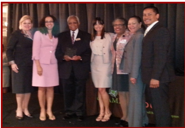
CHI leaders accept the High Growth Award from Chamber South.