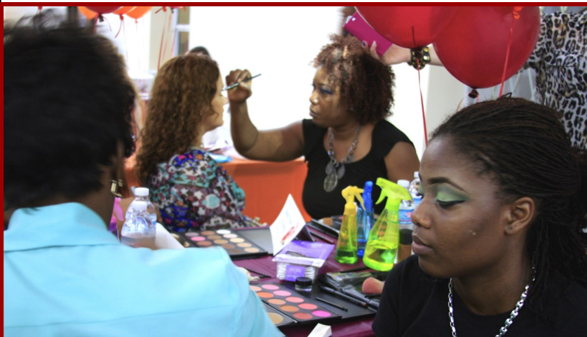
A fairgoer receives a free makeup application from a Beauty Schools of America student.