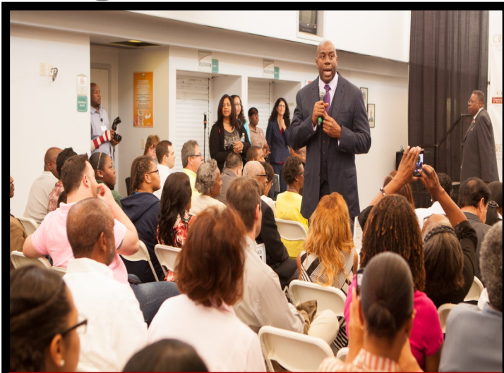
Magic Johnson captivates the crowd at the Doris Ison Health Center

His massive 6-foot-9-inch, 225 pound frame commands attention. But it was Earvin "Magic" Johnson's charisma that truly won over the crowd of more than 200 guests at the Community Health of South Florida Inc. Doris Ison Center. The former NBA All-Star took to the stage with a room full of screaming fans as if he never left the basketball court.