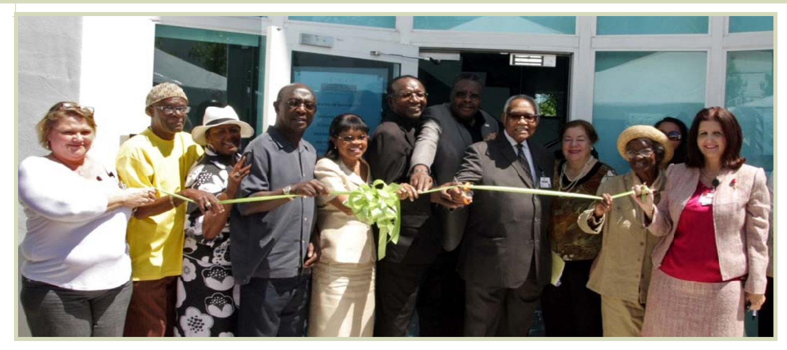
CHI leaders cut the ribbon at the grand opening ceremony of the Coconut Grove Health Center