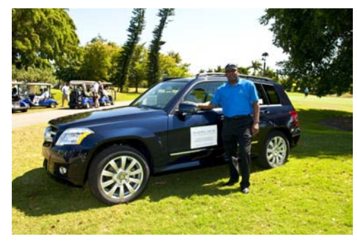
Hole In One Grand Prize Cutler Bay Mercedes Benz