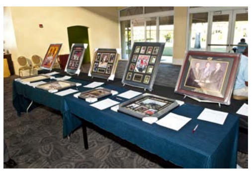
Great raffle items donated to us from the wonderful Sponsors.