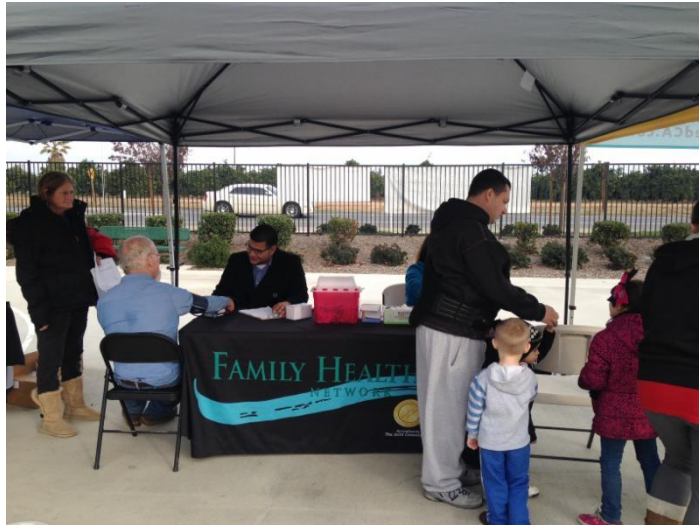
Both children and adults gather to receive medical screenings from FHCN community health staff.

On January 20th, FHCN partnered with The Corporation for Better Housing to host three "Mini Health Fairs" in Woodlake, Ivanhoe, and Porterville. At each event, community health staff and AmeriCorps volunteers provided health screenings, information on FHCN programs and services, information on Covered CA, and education surrounding children's oral health.