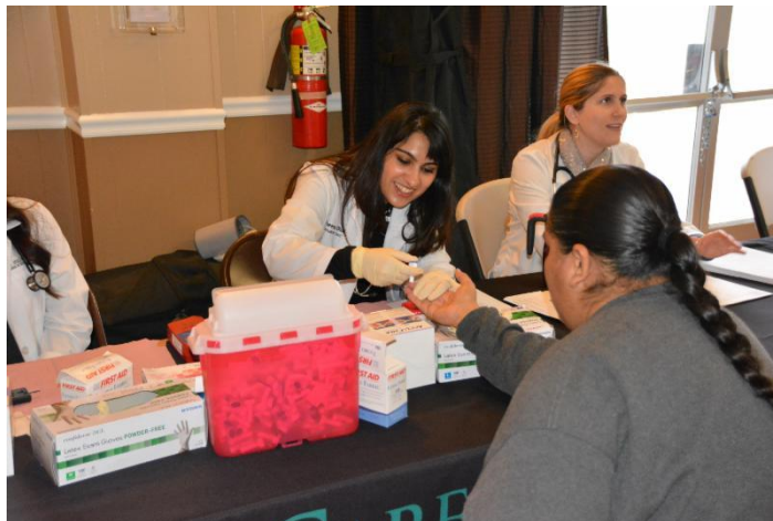
A.T. Still medical students joined FHCN to provide hemoglobin and glucose screenings.

On January 29th, FHCN partnered with several local organizations for the 2015 Project Homeless Connect. This is a one-day, one-stop event hosted in four different cities in Tulare & Kings Counties. FHCN staff and A.T. Still medical students provided both health and dental screenings for hundreds of attendees in Visalia, Tulare, Porterville, and Hanford. FHCN staff members also offered resources on health education and enrollment information. This unique event is designed to provide those in our community who are impacted by homelessness, or are at risk of becoming homeless, with information on