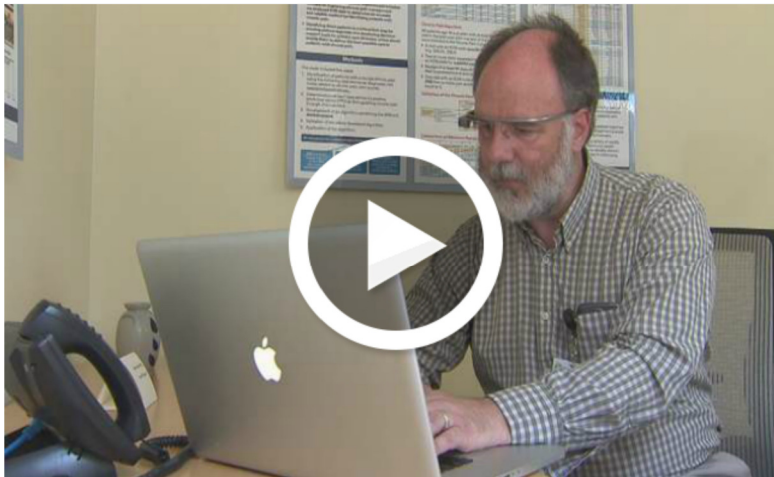
(1/7) They could be the next big thing in the technology world: 'Google Glass' is a wearable computer, a pair of specs that can do everything a smartphone can do; and a Woodbridge man is one of the lucky few who gets to test it out.

Updated: Monday, July 15, 2013, 5:50 PM EDT Published: Monday, July 15, 2013, 3:43 PM EDT