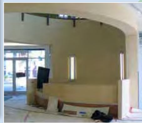
First floor lobby and reception desk

La Maestra's signature leaf patterns welcome visitors at the main entrance. Each leaf pattern is artfully saw cut by hand.