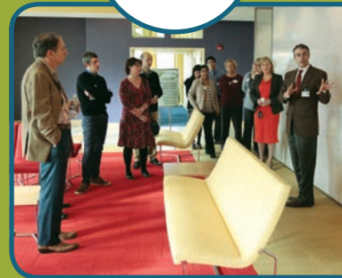
CHC leaders with the Sheffield Teaching Hospitals team.