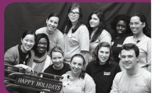
CHC's HealthCorps Navigators (pictured here) helped to make this inaugural event a huge success!

CHC is proud to have hosted an event and is already looking forward to next year's Help-Portrait, which will take place on Saturday, December 7th, 2013!