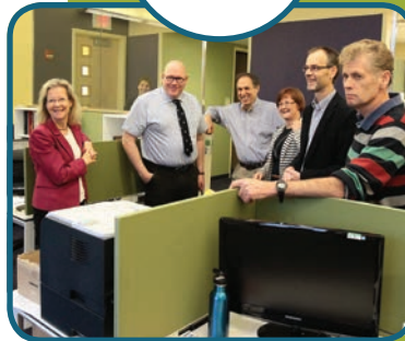
CHC leaders with the Jönköping Academy team.