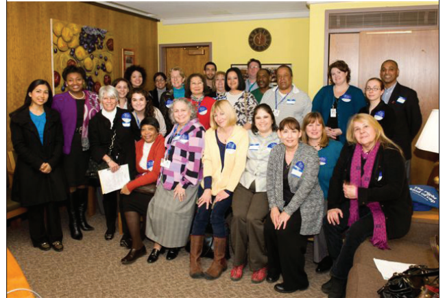
Staff and supporters of Open Door went to Albany to lobby for funding on Community Health Center Advocacy Day on March 7th.

The impact on Open Door is significant. At the Federal level, $500,000 due in 2011 is immediately at risk if Congress doesn't maintain current levels of spending. At the State level, cuts of nearly $300,000 are already certain. While Westchester County appropriated essential public health funds, thanks to pressure from the Board of Legislators, it has delayed issuing contracts for payment.