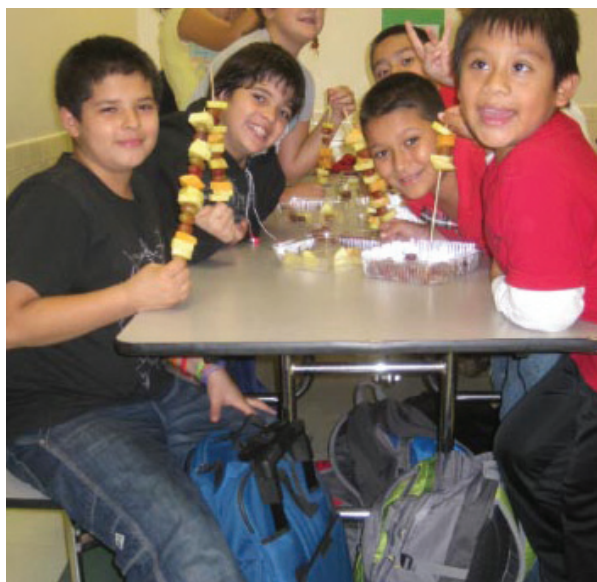
Kids with fruit kabobs.