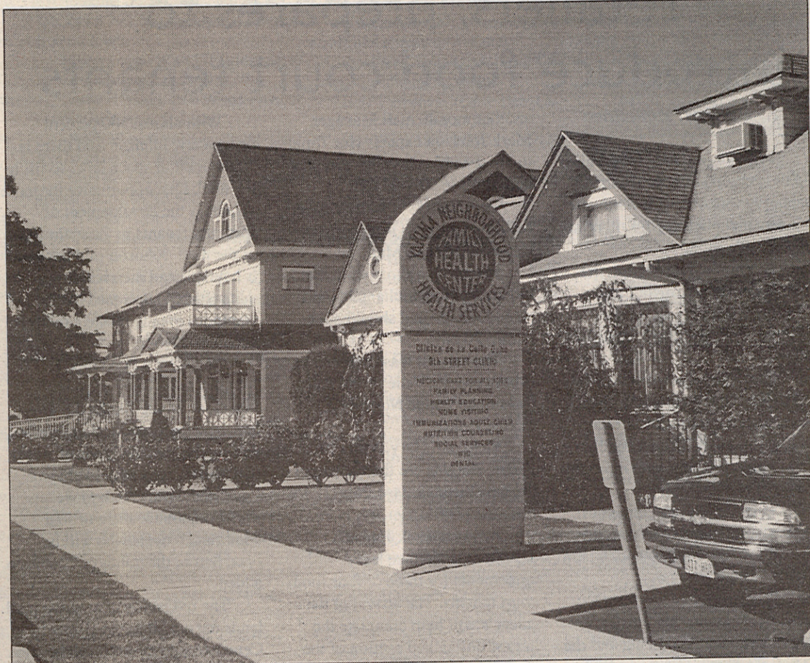
RICHEY HOUSE. A century old, the Richey House (center, with high roof) served as a private home, office and apartment house before being moved to the YNHS campus on South 8th Street.

connects the house to the rest of the campus, holds a second reception area for patients on the first floor and 15 new exam rooms on the second.