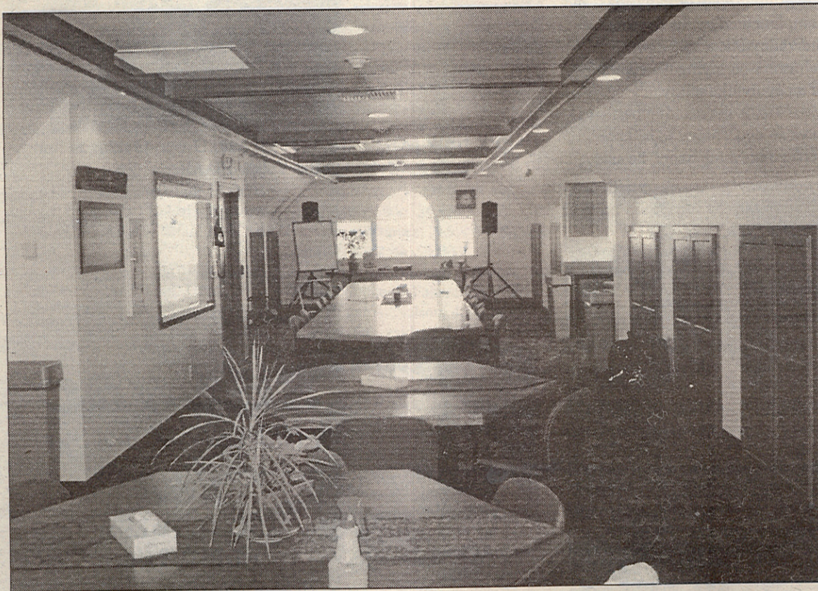
COMMUNITY ROOM. This conference room on the third floor is available for use by community groups.

YNHS has also received an exceptional review recently from the Joint Commission on Accreditation of Healthcare Organizations, which accredits hospitals nationwide.