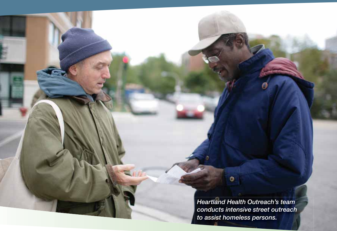
Heartland Health Outreach's team conducts intensive street outreach to assist homeless persons.