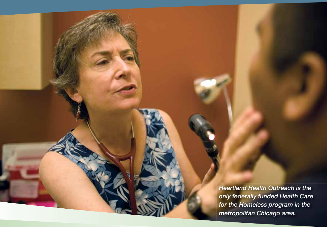
Heartland Health Outreach is the only federally funded Health Care for the Homeless program in the metropolitan Chicago area.