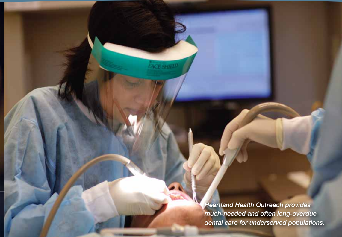
Heartland Health Outreach provides much-needed and often long-overdue dental care for underserved populations.